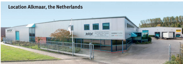
Location Alkmaar, the Netherlands